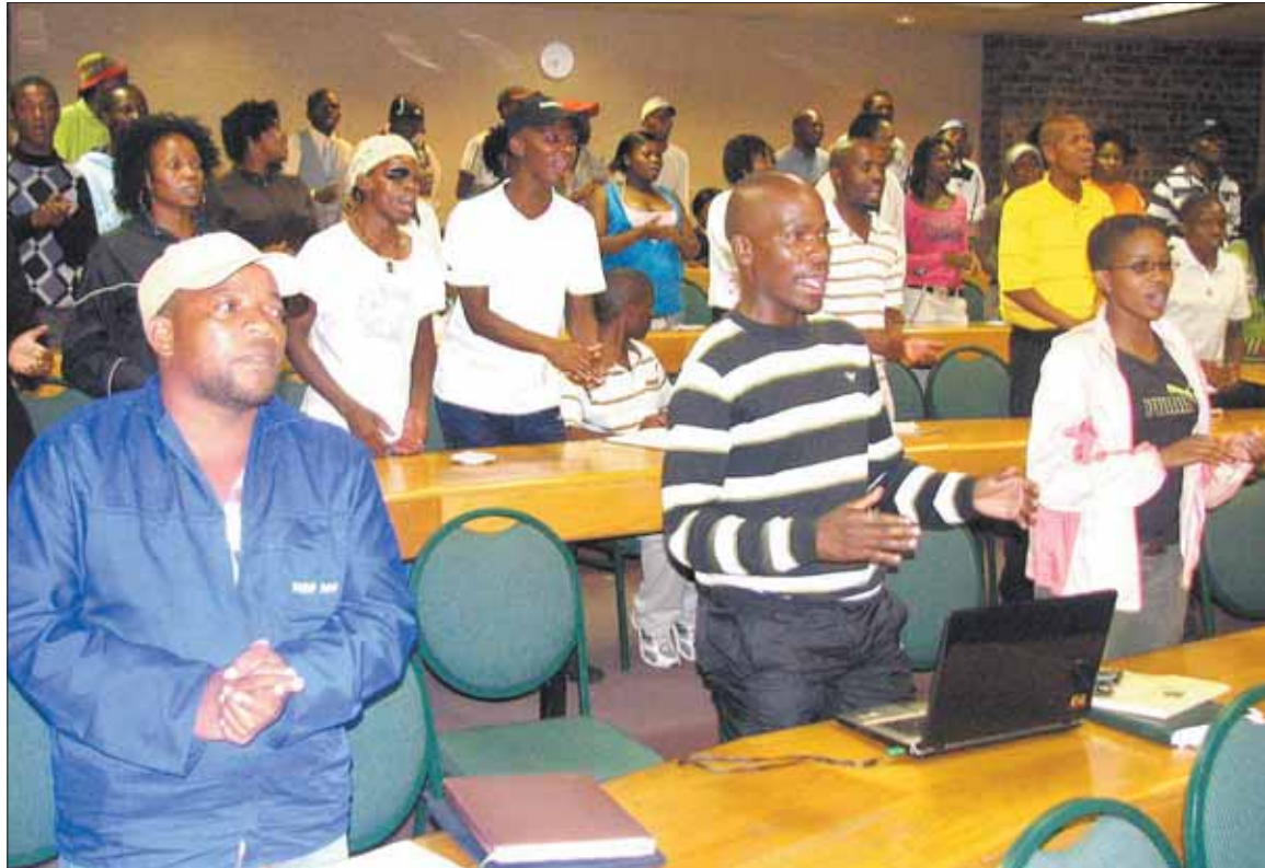
LEADERS OF TOMORROW: Mogale City youth chant slogans at the launch of a new structure of the Mogale City Local Youth Forum.