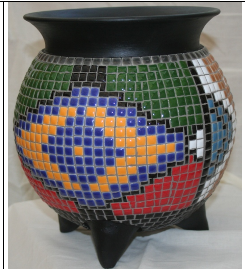
Photo 2 Another sample of proposed mosaic art finish reflecting Ndebele styling on art stands