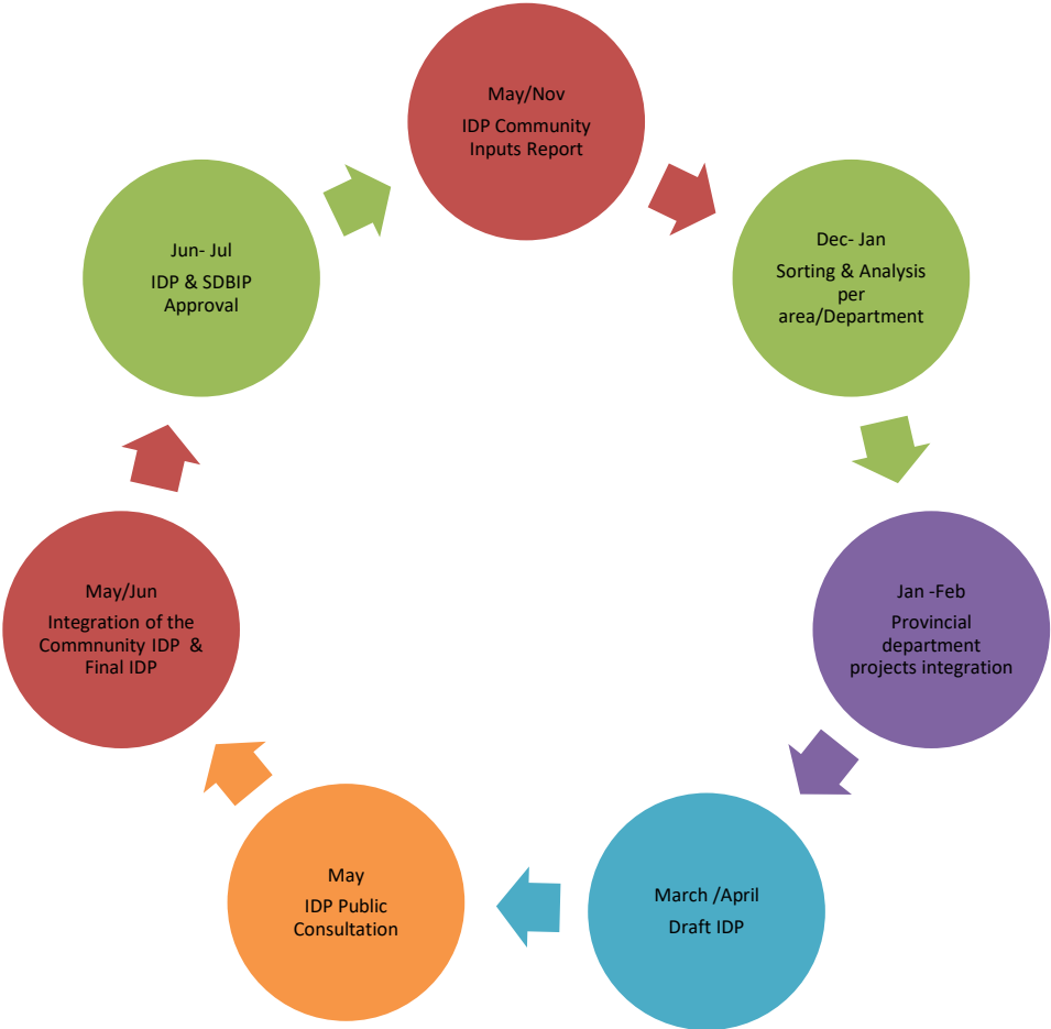
FIGURE 3: PROCESS FLOW FOR IDP COMMUNITY INPUTS

Figure 5, above, refers to the IDP community needs inputs process flow. The process flow provides a guideline on the IDP capturing of community inputs received during IDP roadshows. Immediately after the IDP Roadshows, the process flow indicates that community needs will be captured.